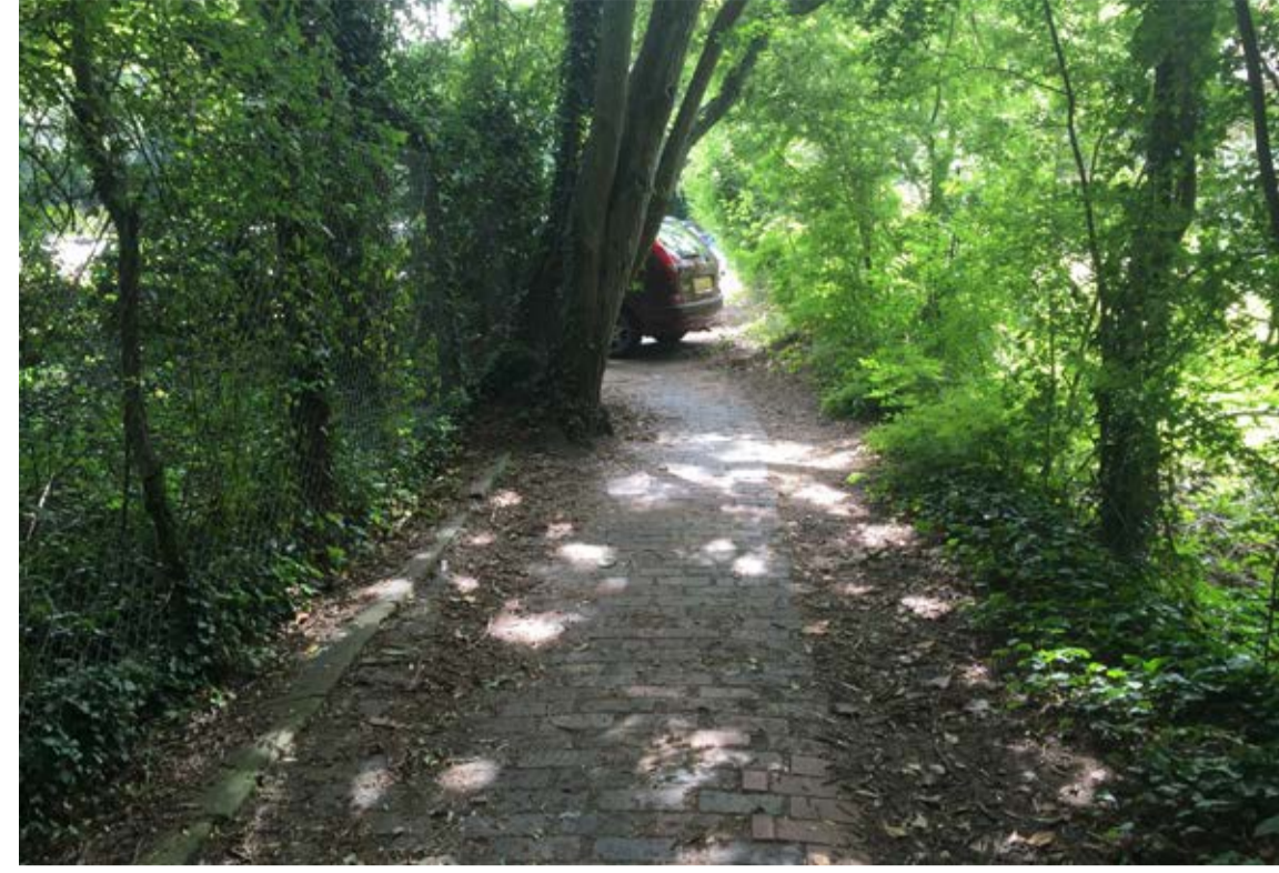
Remains of former railway platform