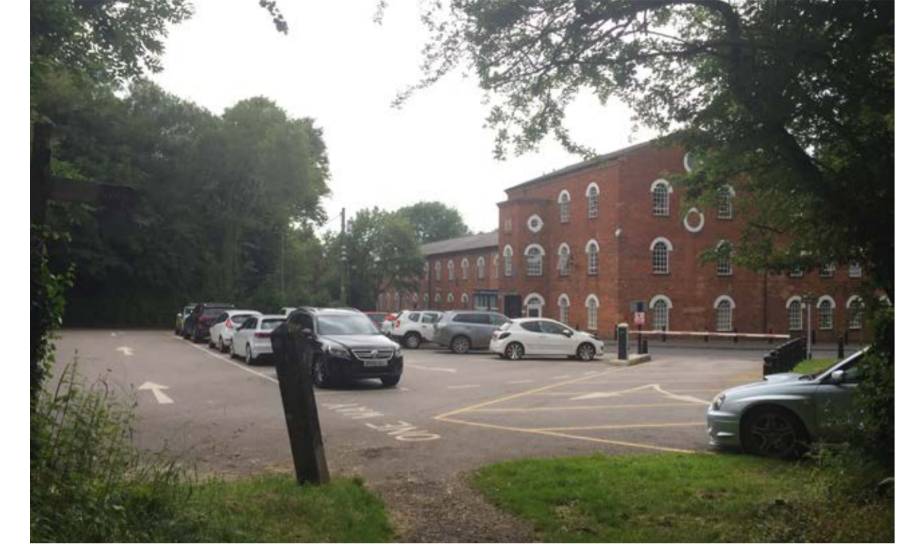
View of site from circular walk.