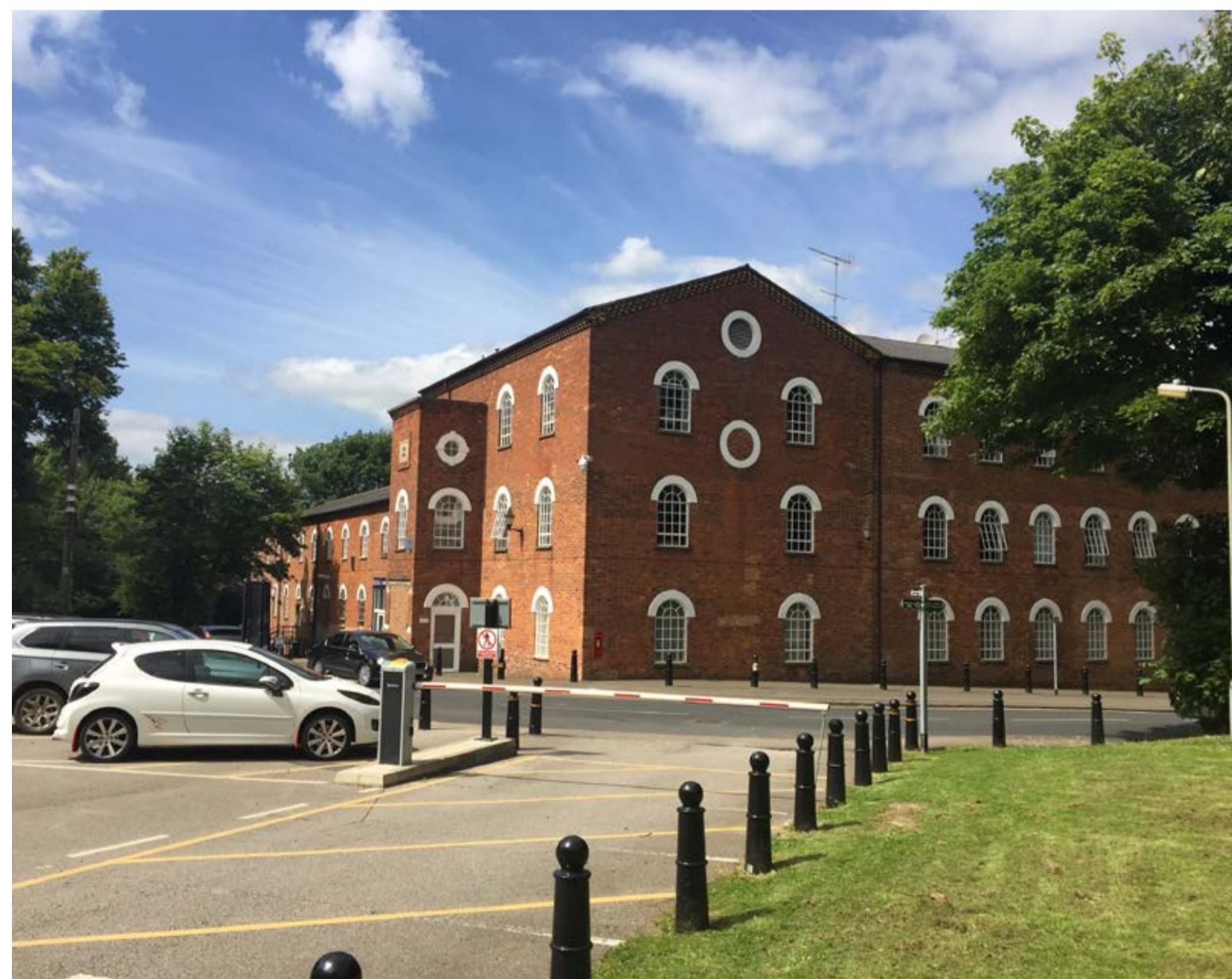
Chandos Road Building home of the University Medical School.