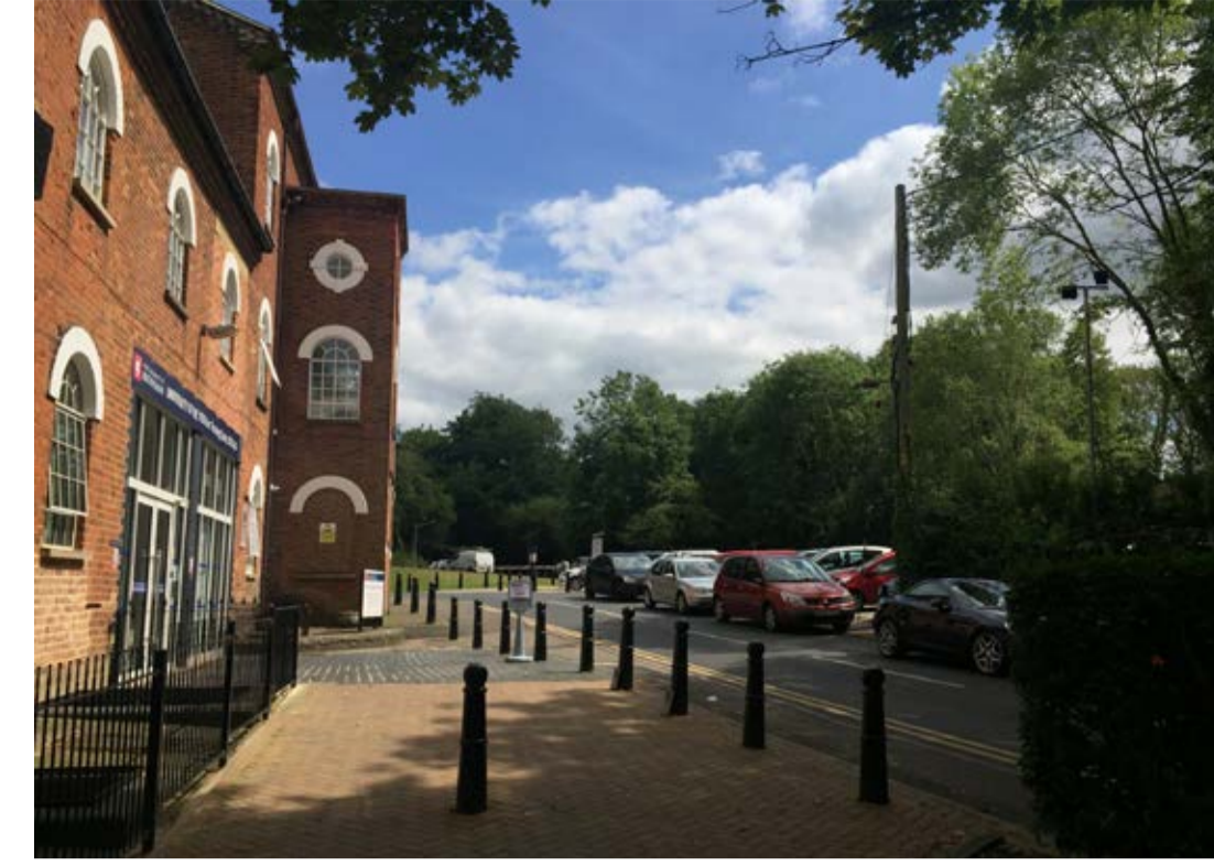
View from Station Road Entrance to Medical School