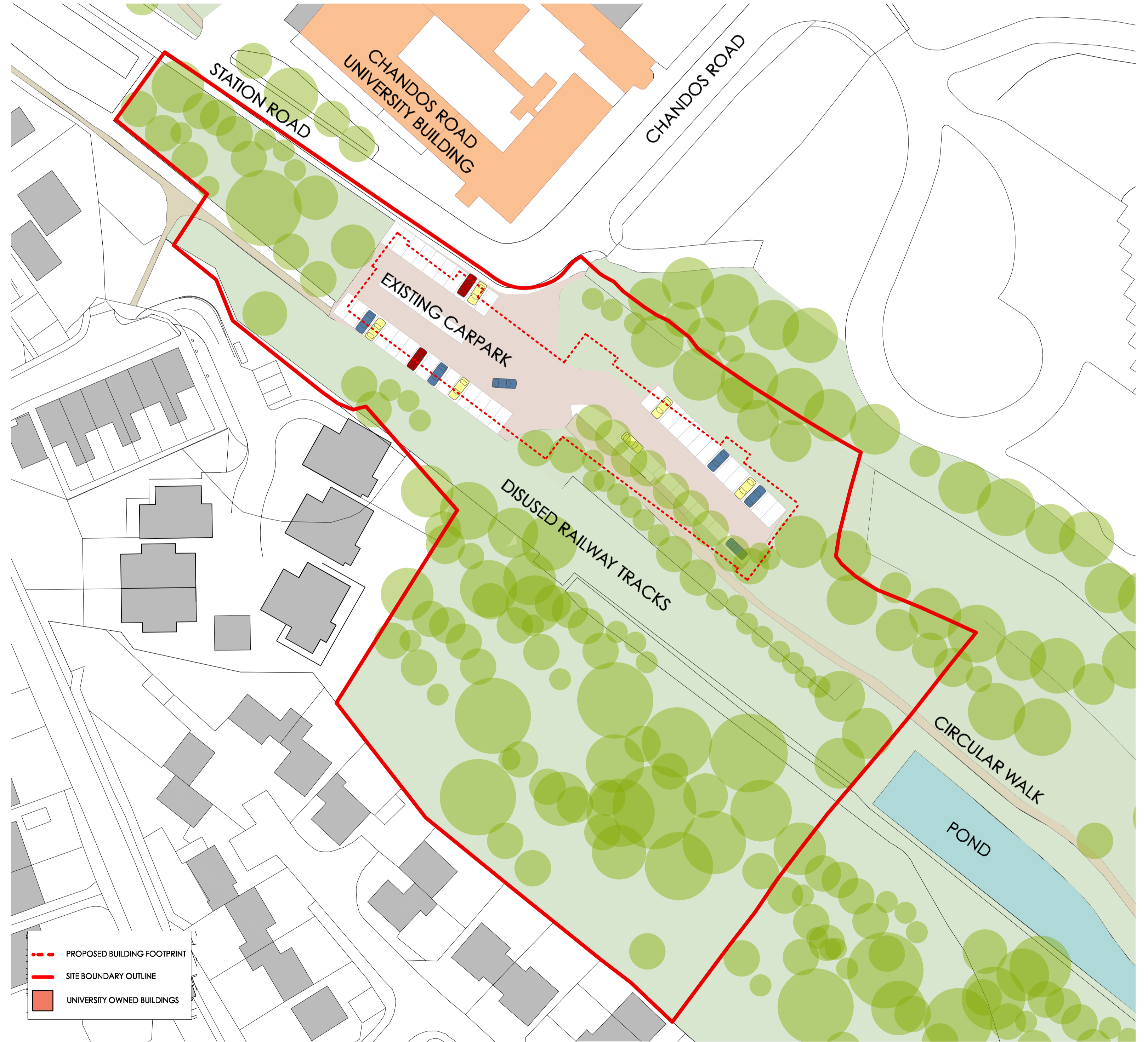
Existing Site Plan - Footprint of Proposed Building Outlined in Red