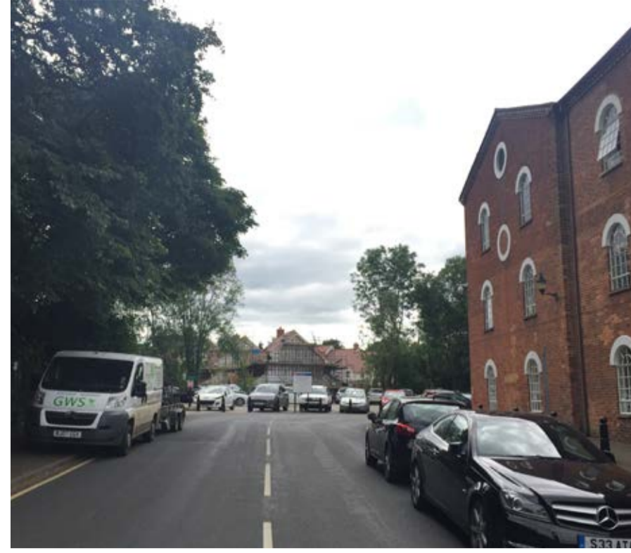
View from Chandos Road looking South West

The remainder of the woodland beyond the former railway line will not be affected by the proposals.