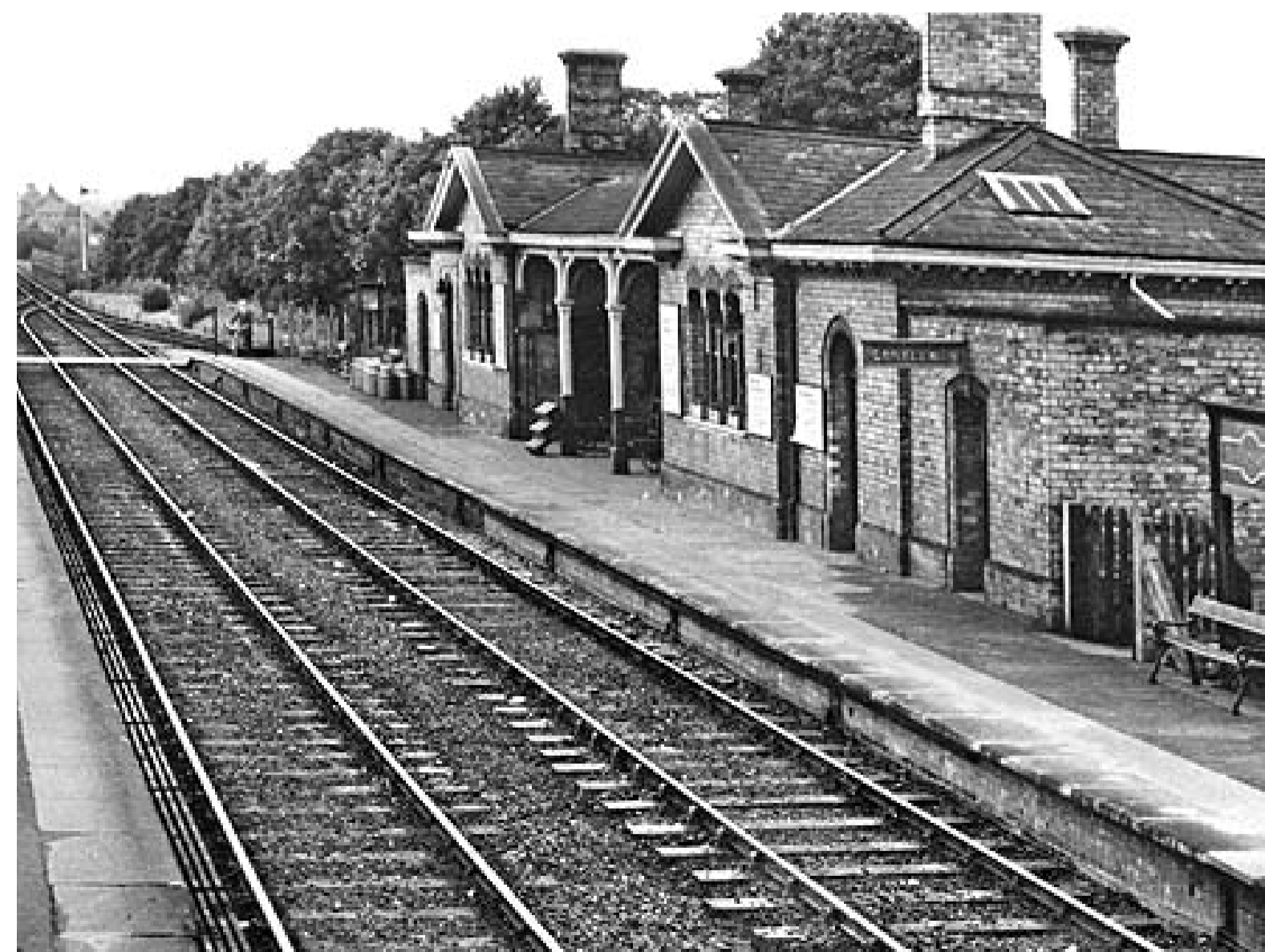
1950 - Buckingham Railway Station Building