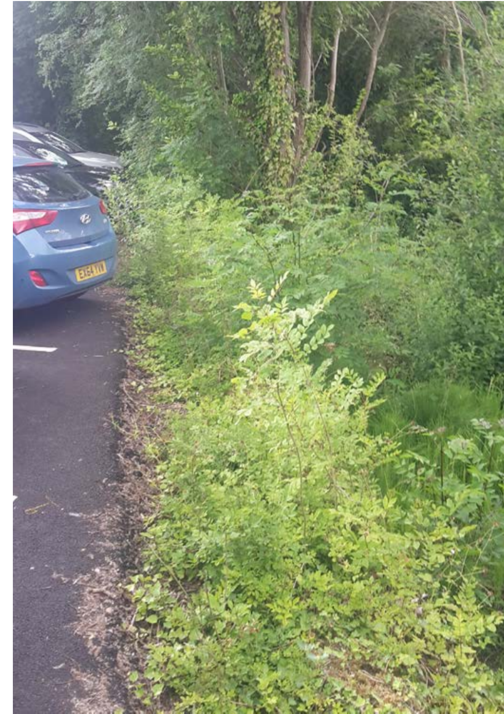
Now - Dilapidated Platform Edge