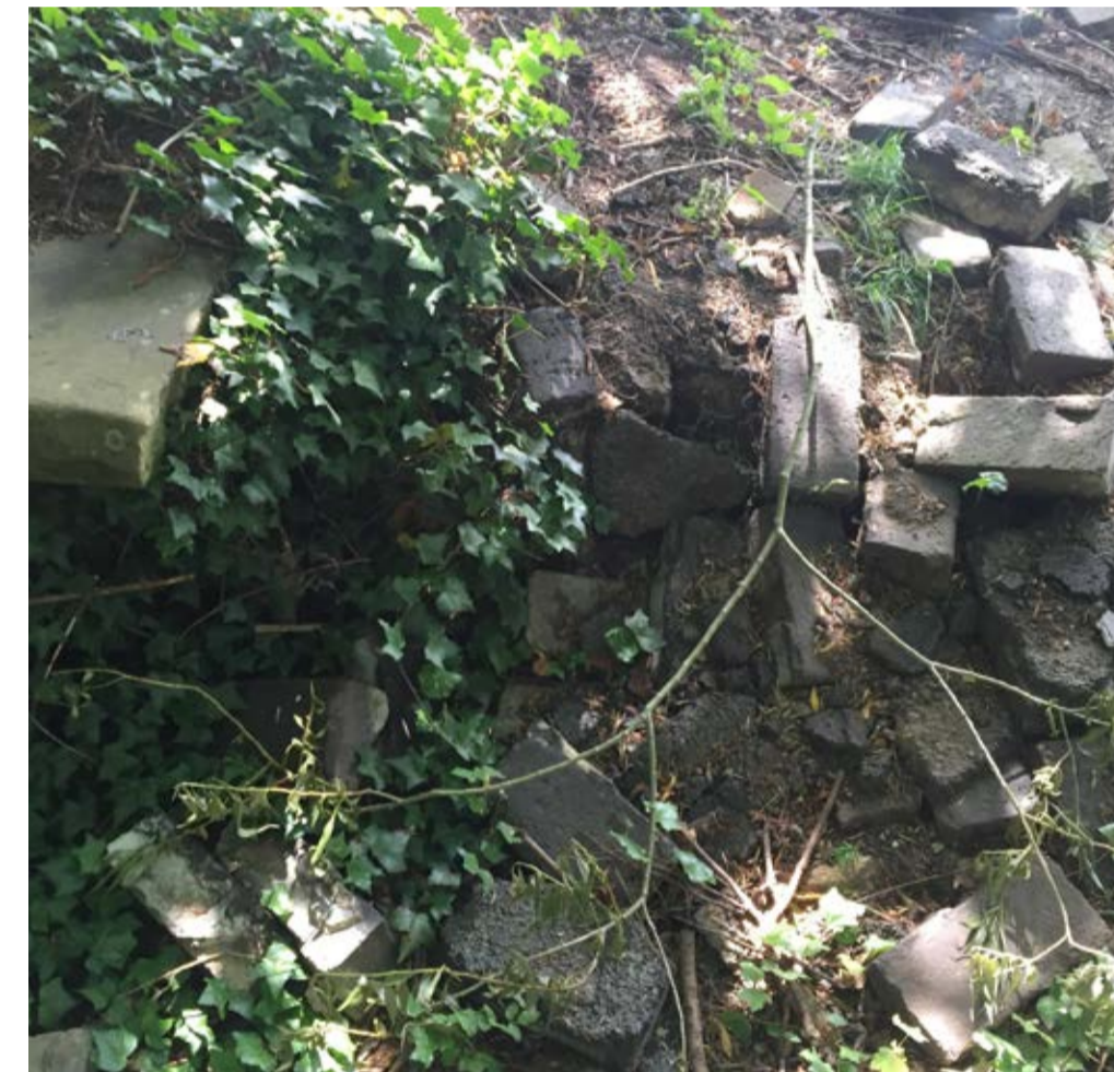
Now - Collapsed Platform Bank