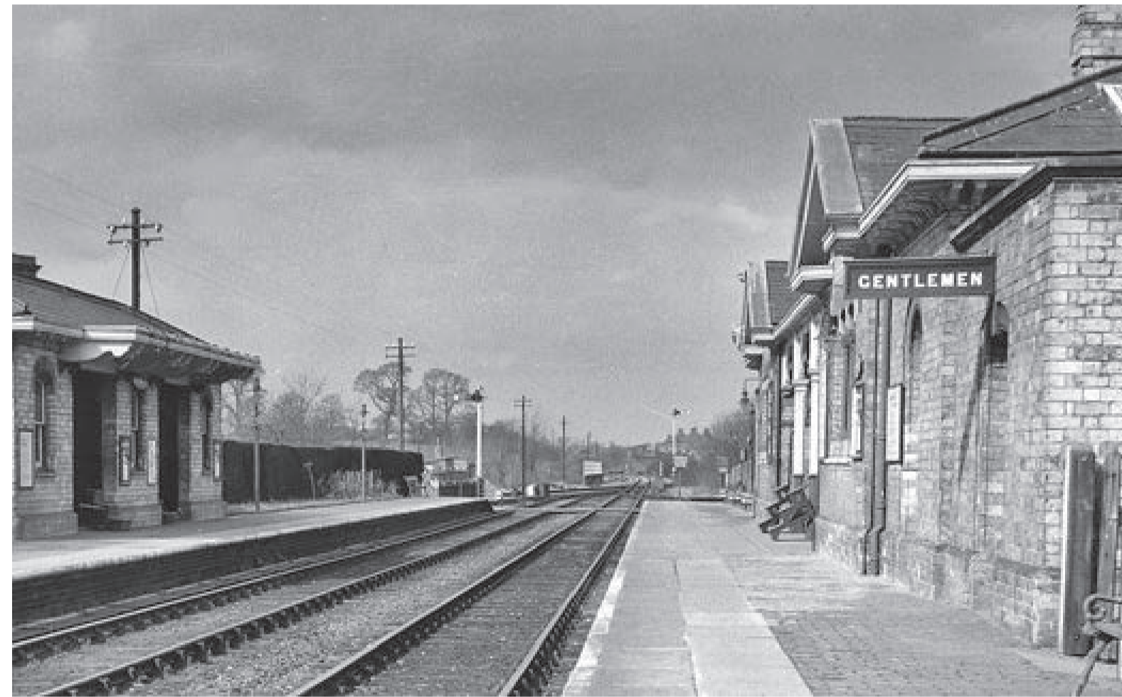
1932 - Former Railway Platform