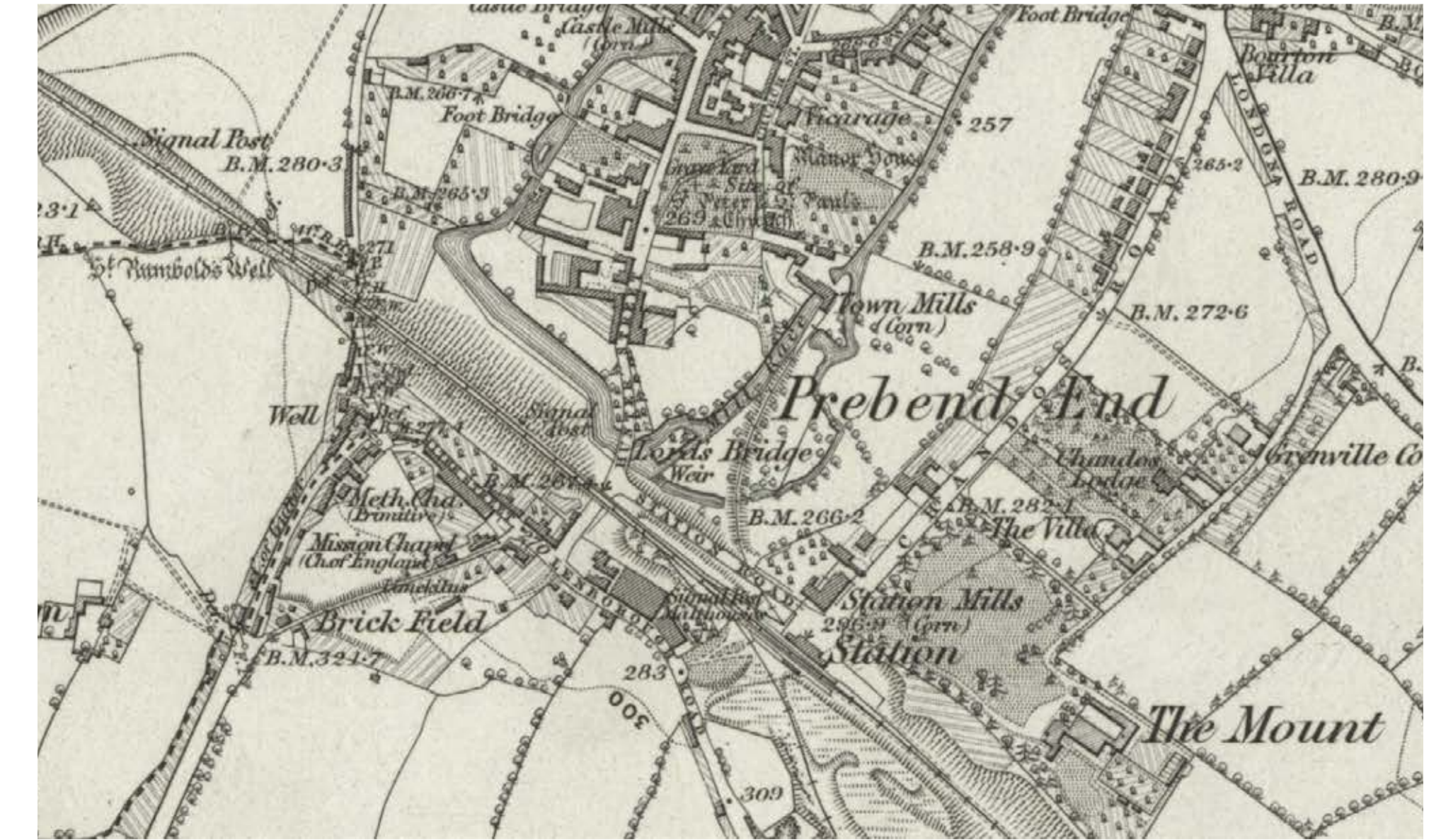
1885 OS Map showing former Railway Station Buildings.