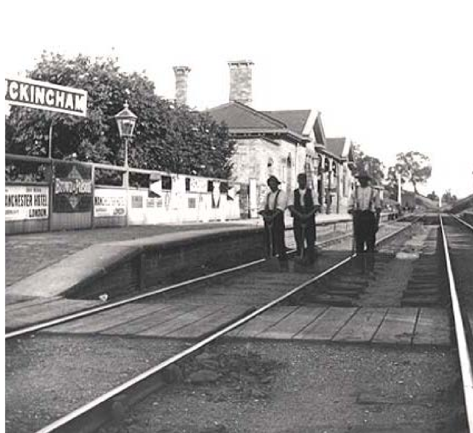
1897 - Track Workers at Buckingham Railway Station

The long term aim is to re-landscape the trackbed area to form a linear parkland space.