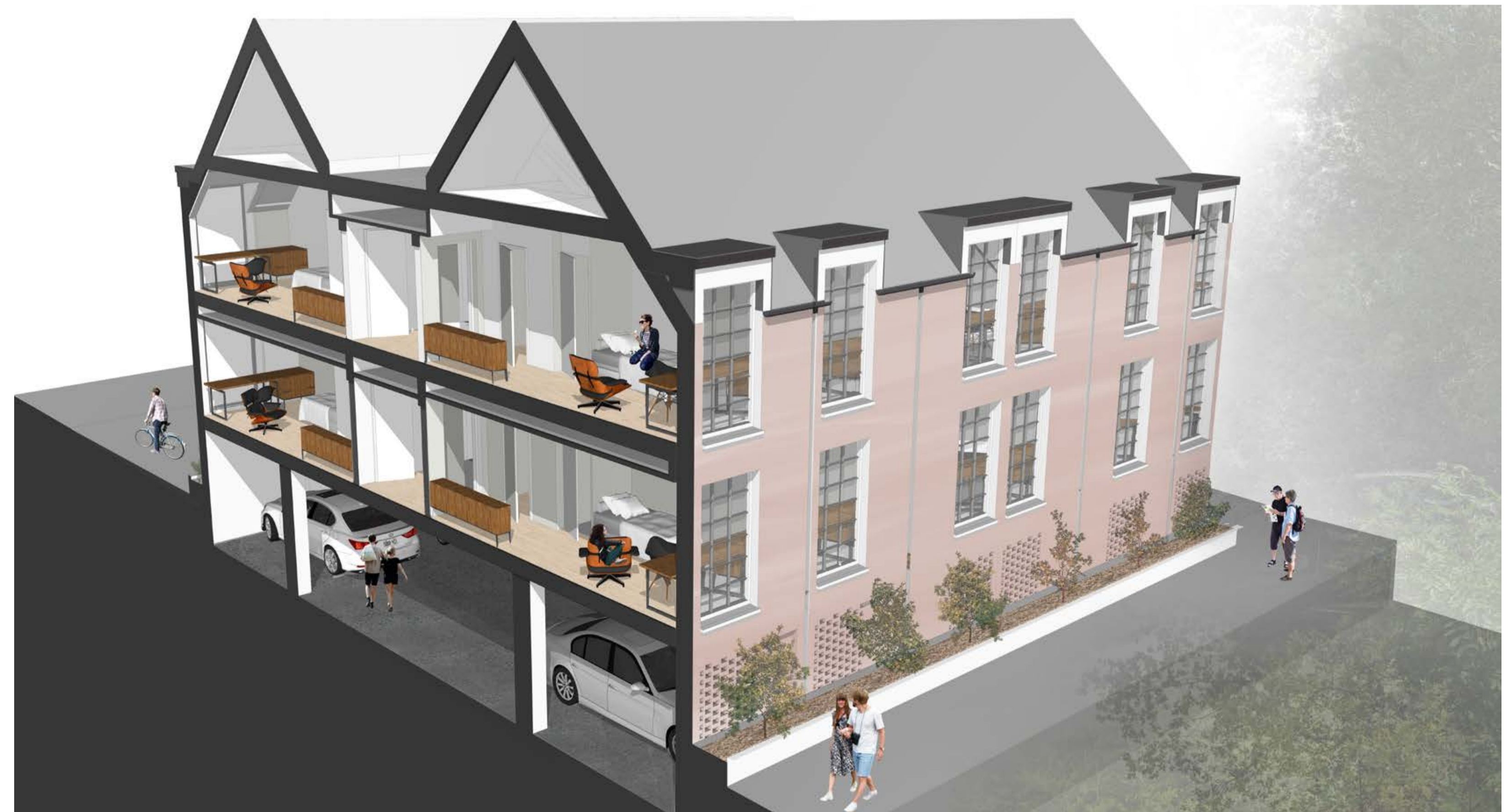
3D sectional view of building from proposed refurbished railway trackbed.